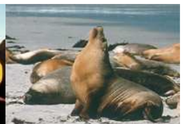
Australian Sea lion

for Wine or Reason Info@forwineorreason.com.au www.forwineorreason.com.au +61 (0) 438 388 883